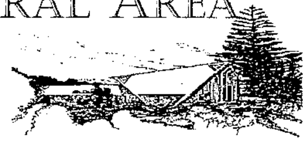
ST PETER'S, ONERUA WAIHEKE ISLAND